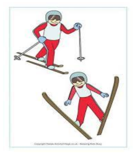
Become a ski guide

That was my thinking when I signed up to guide with SRSFL. I had no idea what I was getting into and I ended up with a weekend to remember. After the first 15 minutes on the snow my skier was hating it, wanting to turn back and wondering why she came. By the end of Monday, not only did she promise to